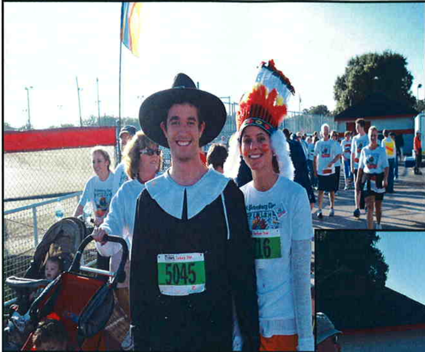
Turkey Trot, Clearwater, FL